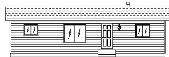
SAMPLE FRONT ELEVATION

***TRIPLE M HOUSING LTD. HAS AN UNSURPASSED COMMITMENT TO PRODUCT QUALITY AND INNOVATION. IN ORDER TO MEET AND EXCEED MARKET DEMANDS TRIPLE M RESERVES THE RIGHT TO MODIFY PLANS, SPECIFICATIONS AND/OR PRODUCT FEATURES AT ANY TIME WITHOUT PRIOR NOTICE. DUE TO PROVINCIAL, STATE AND/OR OTHER DESIGN REQUIREMENTS SOME VARIANCE IN STANDARD FEATURES MAY OCCUR. PLEASE CONSULT YOUR LOCAL TRIPLE M RETAILER FOR MORE INFORMATION.