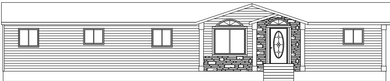
SAMPLE SIDE ELEVATION