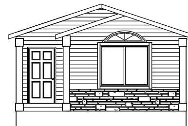
SAMPLE FRONT ELEVATION